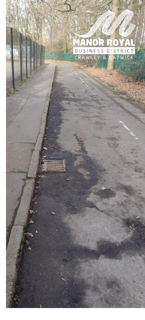
Magpie Walk has also had footpaths and cycle paths cleared of leaves and detritus.