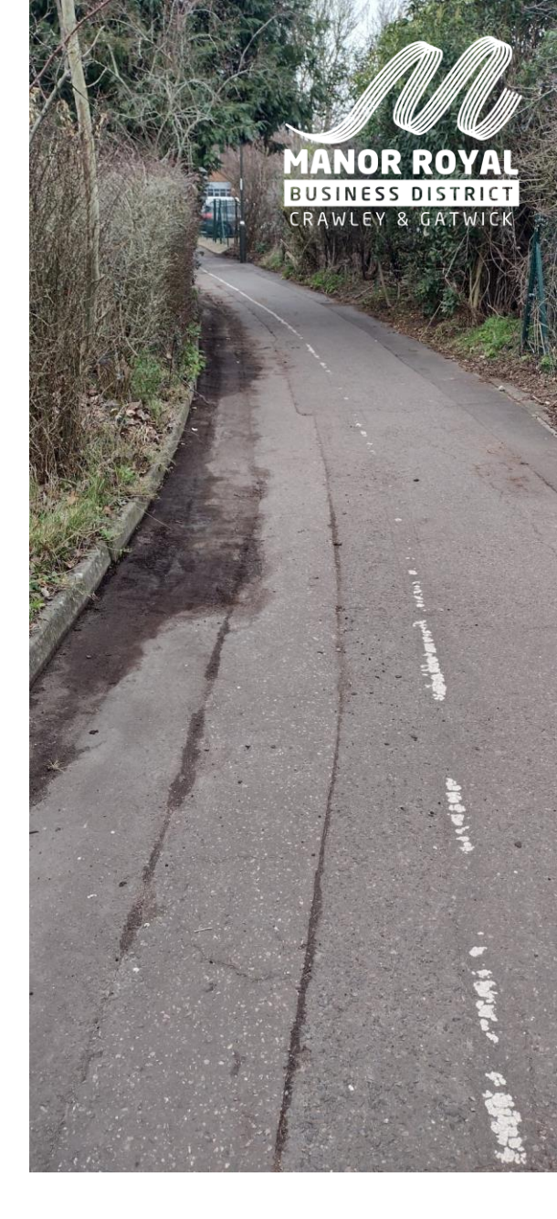
Leaf and detritus has been cleared along Woolborough Lane cycle path.